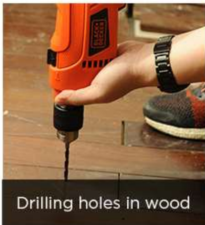
Drilling holes in wood