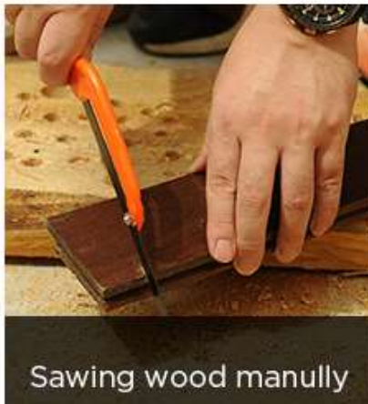
Sawing wood manually