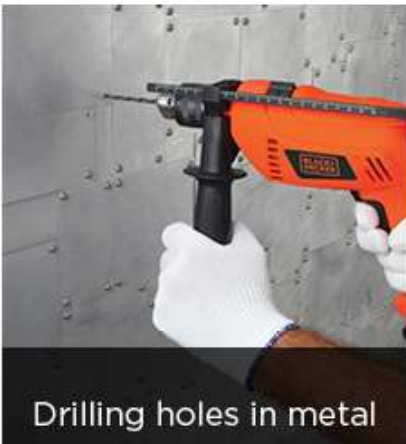
Drilling holes in metal