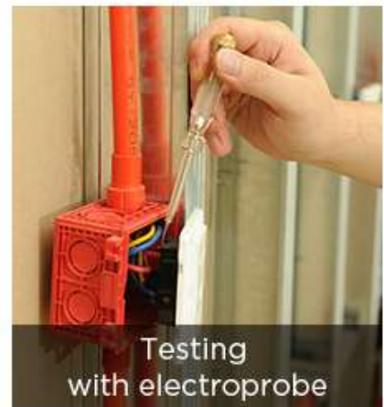
Testing with electroprobe